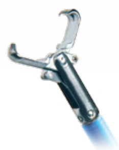
Type: 2-1 teeth