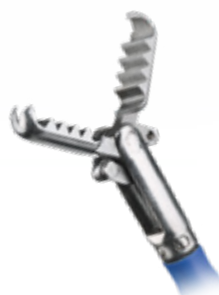
Type Griffin: long alligator jaw with 2:1 teeth