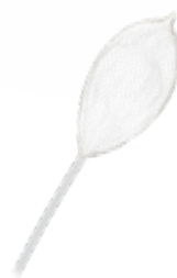
Shape stable MT net