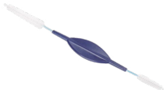
Double headed cleaning brush for air-water valve

MICRO-TECH offers the all inclusive solution for the thorough brushing of the air-water valve vents and ports. The double header brush combines a 40 mm long and 11 mm thick port brush with a 20 mm long and 5 mm thin vent brush. Both brushes are flexible and have protective distal beads to help prevent damage to the endoscope.