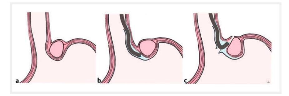
▶ Fig. 1 Schema of submucosal tunneling endoscopic resection technique. a Submucosal tumor. b Submucosal tunneling. c Muscular layer dissection and evidence of a mucosal tear.